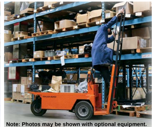
Note: Photos may be shown with optional equipment.