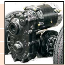
GT Automotive Drive (SC-100 only)