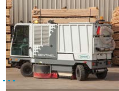
Optional rear view camera provides additional visibility for easy maneuvering.