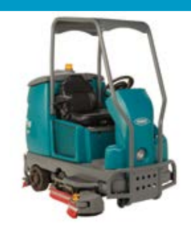
Protect operators from falling objects with the overhead guard and protect the T16 from contact damage with the severe environment front bumper.