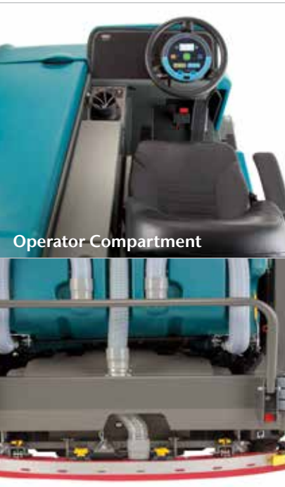
Yellow Maintenance Touch Points

Overhead guard protects operators from falling objects.