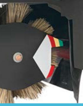
Exclusive color coded brush wear indicator for correct brush position