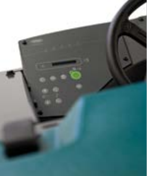
Optional 1-Step™ start button simplifies operator training with controls that enable sweeping systems to be activated with a single green button