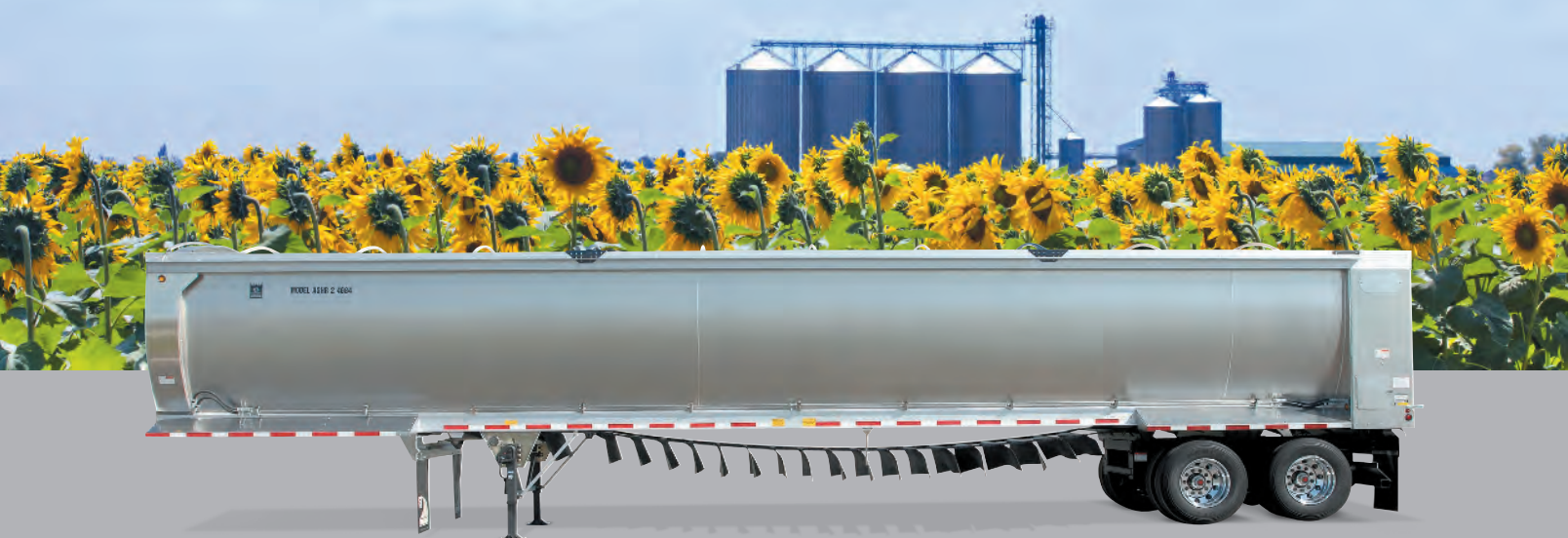
Segmented Belt Model