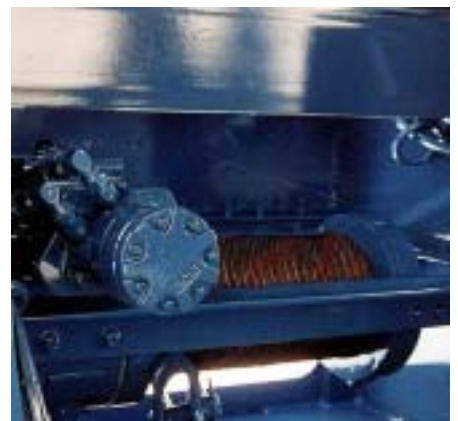
Optional winch built into gooseneck slope.