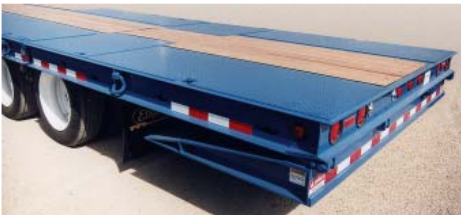
Etnyre custom designed tiedowns and optional stake pockets.