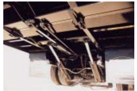
Heavy duty Etnyre folding tail design.