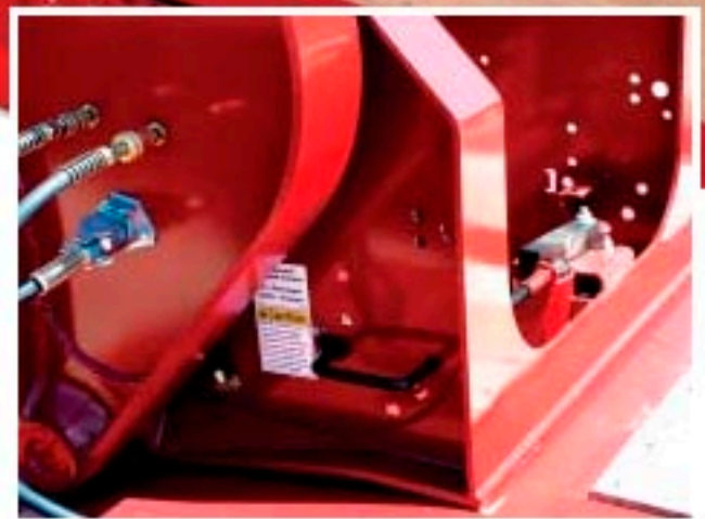
Gooseneck lock pin