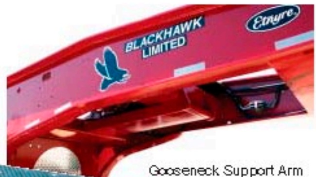
Gooseneck Support Arm