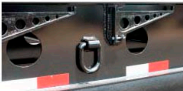
Flat style lash rings and outriggers

Shown with optional bolt on aluminum gooseneck cover and center deck.