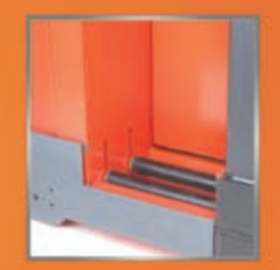
Lift-out battery gate and corrosion resistant rollers allow easy battery removal from both sides of the unit for faster replacement and service.