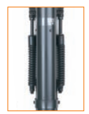
Spring suspension system isolates the vertical vibrations that occur while traveling, to improve operator comfort and productivity.

Low-effort. flush-mounted brake pedal allows increased freedom of movemen for greater operator comfort.