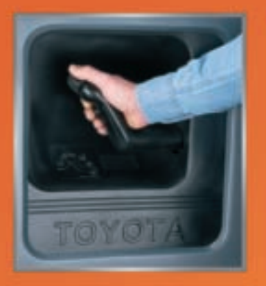
Multifunction control handle is contoured to provide superior comfort for the hand, wrist and arm.