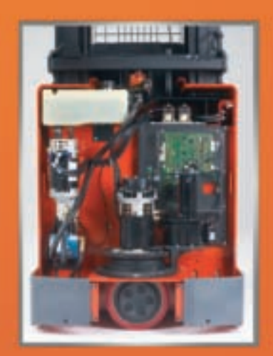
Power unit tractor cover is easily removed to provide access to major components. reducing service time during inspection and maintenance.