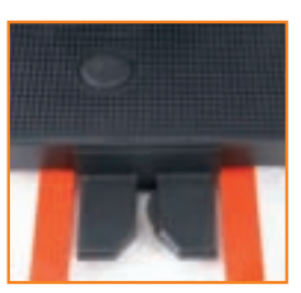
Pallet centering guide with automatic clamp helps ensure the pallet will remain secured to the forks.

Optional flip-up side gates can be nested out of the way to allow easy access for picking.