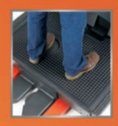
Bubble-cushioned floor mat is designed to reduce the effects of vibration and standing stresses to limit body fatigue.