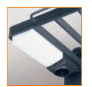
Optional light and fan package provides a more comfortable operator working environment.

Pallet centering guide with automatic clamp and foot release pedal for convenient, efficient pallet handling.