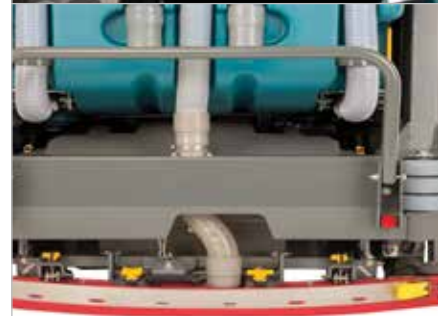
Yellow Maintenance Touch Points