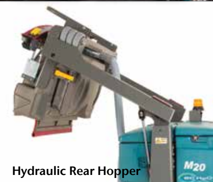
Hydraulic Rear Hopper