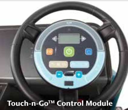
Touch-n-Go™ Control Module

▶ Touch-n-Go™ control module with 1-Step™ start button allows operators quick access to all settings without removing hands from the steering wheel.