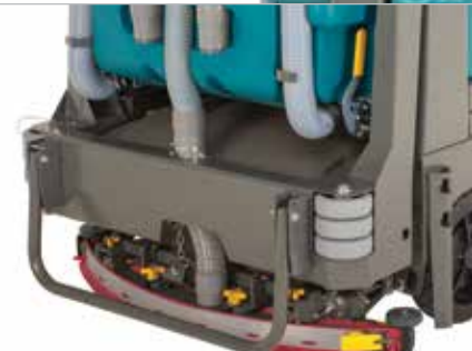
Dura-Track™ Parabolic Squeegee

Overhead guard protects operators from falling objects.